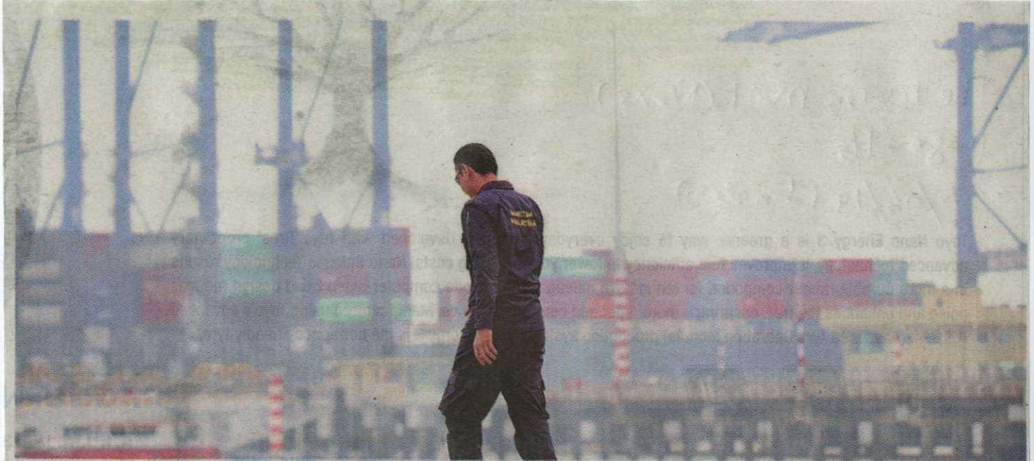
A Malaysian Maritime Enforcement Agency personnel in hazy Port Klang yesterday. The Malaysian Meteorological Department says the situation does not pose any danger for now.

KUALA LUMPUR — The Malaysian Meteorological Department has said the Air Pollutant Index (API) readings for parts of Kuala Lumpur and Selangor pose no danger.