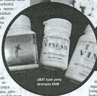
UBAT kuat yang dirampas KKM.

ambil tanpa kawalan dan nasihat pakar perubatan boleh menyebabkan penggunaanya